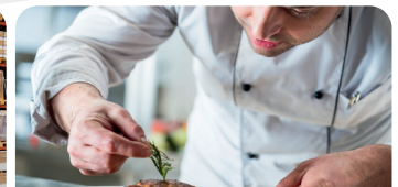
HOTEL & GASTRONOMY