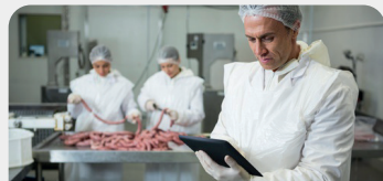
MEAT PROCESSING PLANTS