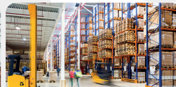
TRADE & SERVICES